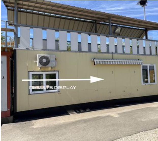
Podium & control tower

A security guard will be on site every night from Wednesday evening through to Saturday.