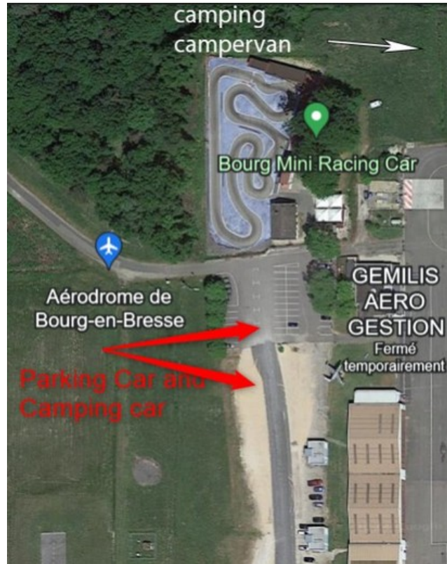
Parking & campsite access