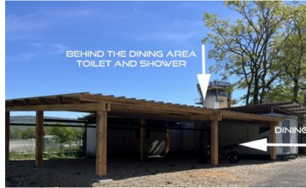
Dining area & facilities