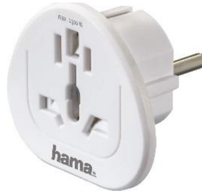
Travel adaptor for german sockets

As power sockets we use are German standard SCHUKO-sockets which can be used with SCHUKO-plugs, European plugs, or travel adapters.