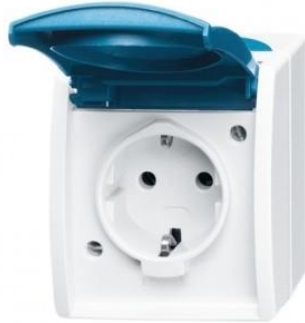
German SCHUKO power socket