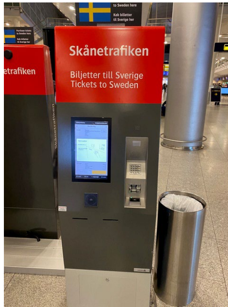
Pic 2 Buy ticket to Hylle