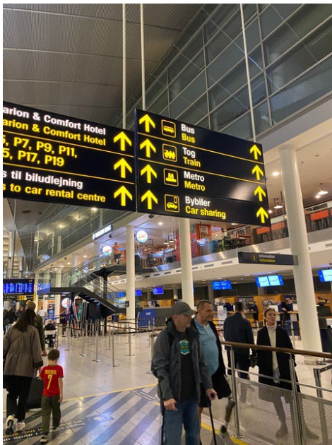
Pic 1 Follow to Train