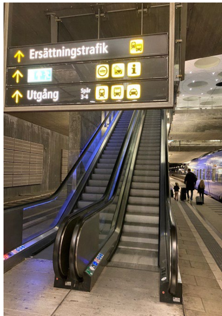
Pic 5 When coming up you have the hotel to right direct after the stairs/ Elevator