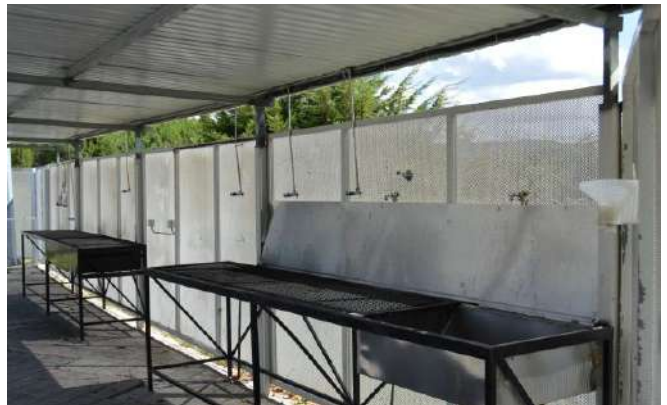
Setting Table and / Cleaning Area