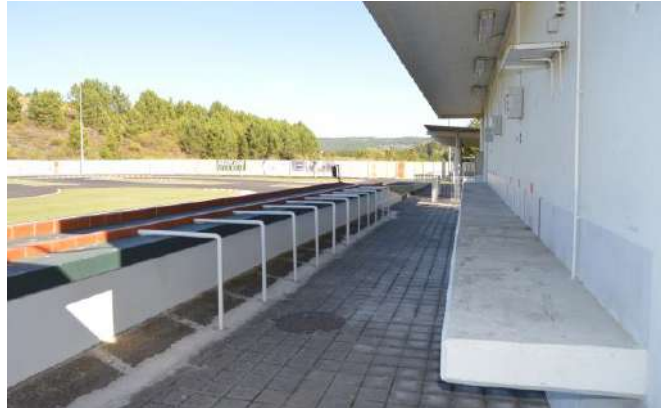
Driving Stand Stairs