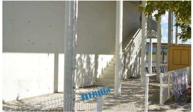
Driving Stand Stairs