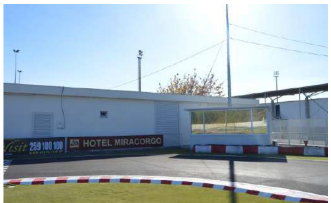
Timing and Arbitration Room