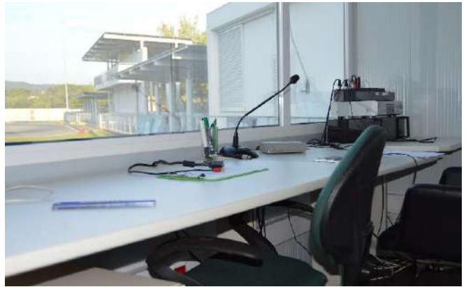
Timing and Arbitration Room – Inside View