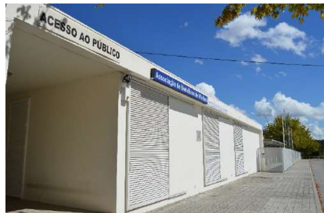
External Support Area