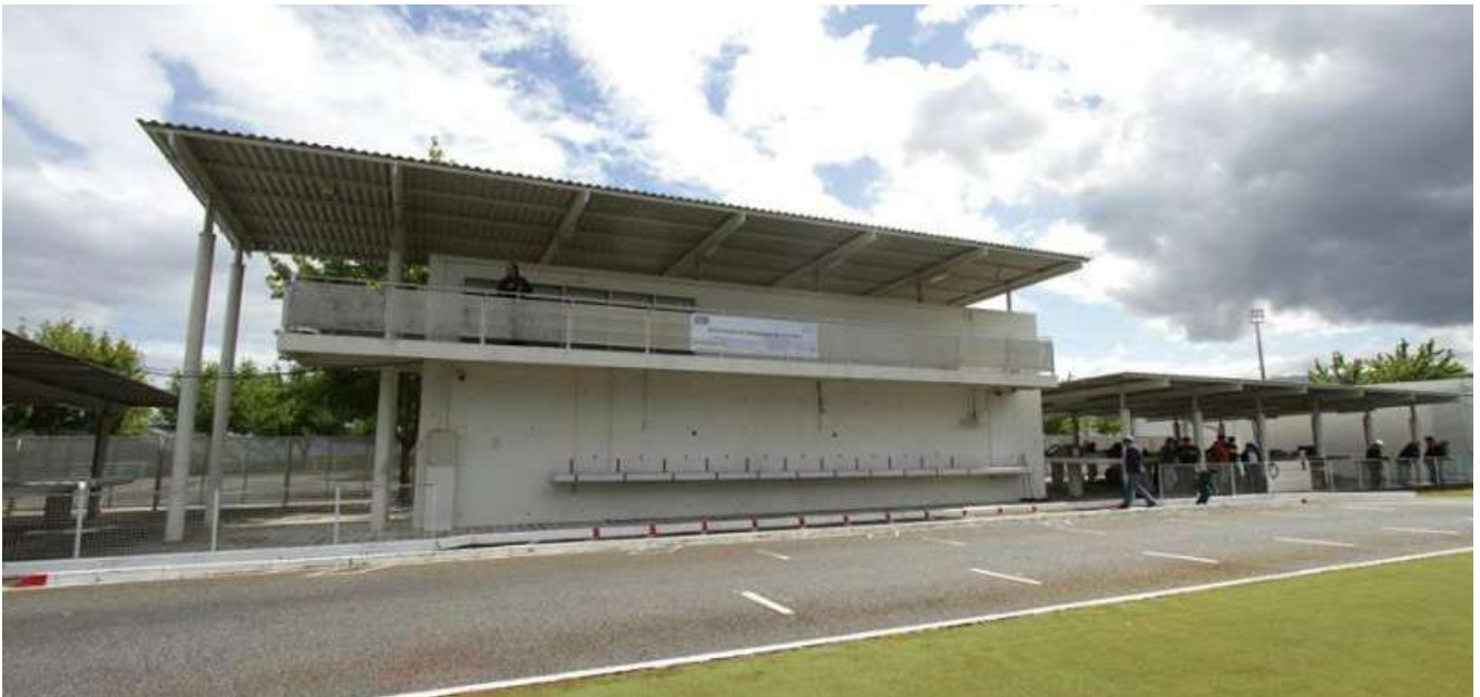
Drivers Stand and Pits