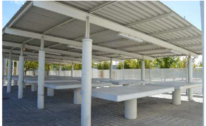
Boxes 200 Places