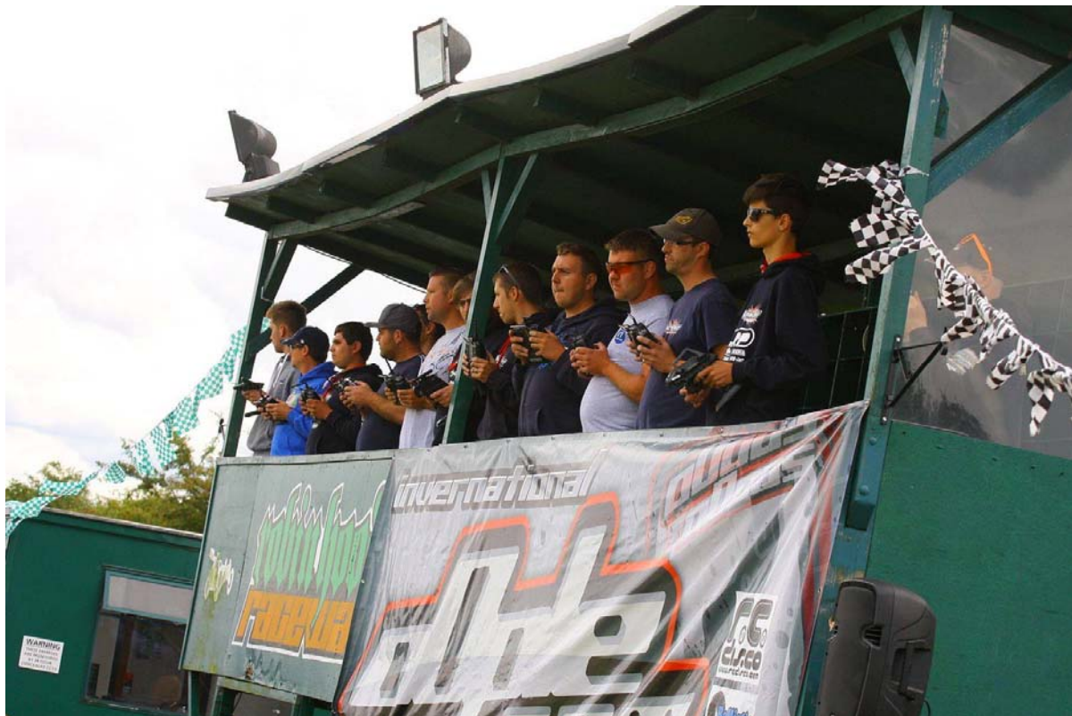
Photo taken 2017. Rostrum now upgraded – No front vertical posts and new roof.

The rostrum is 10m wide, 1.5m front to back, 2.3m high at foot height. It has a rear sloping roof with guttering. There is a shelf for general use to the rear. It has permanent power with dedicated speakers, two monitors and network points behind the drivers. Access is via two sets of steps from the rear, one up and one down. The track is also floodlit from the roof of the rostrum.