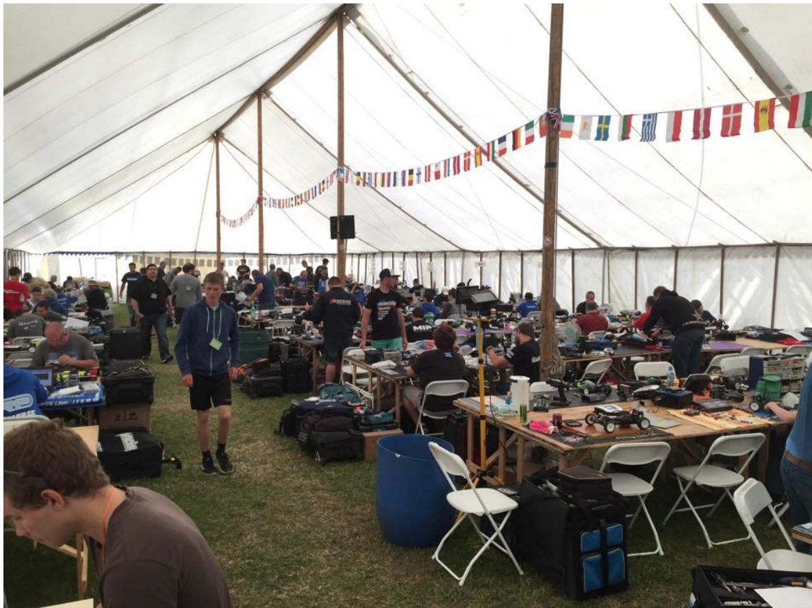
Photo taken of larger marquee at 2015 EC.