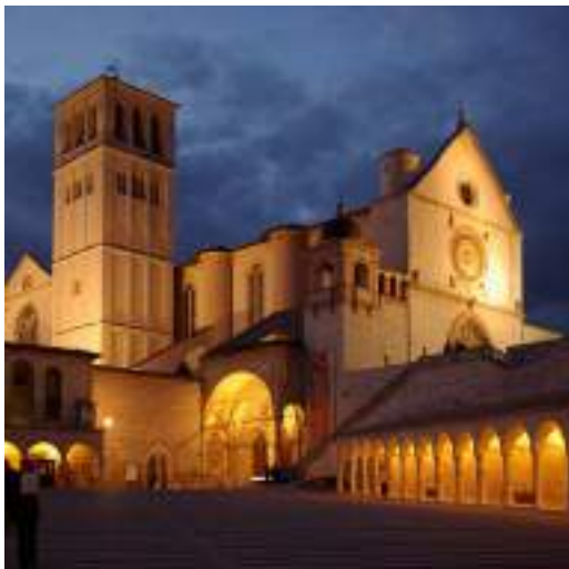
Assisi_san Francesco cathedral

The club wants to make the event exciting and unforgettable for both drivers and their families!