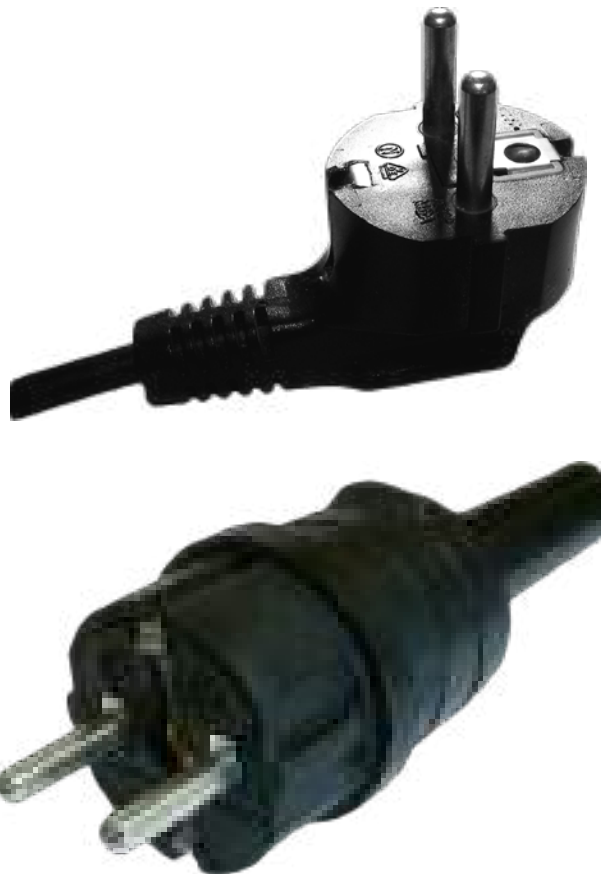
2 pol SCHUKO