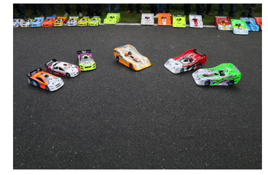
go. I'm sure that quite a few of them would still do really good at the EC-As.

Wow, unbelievable how fast these "old guys" can still